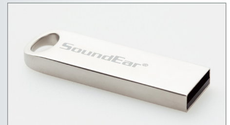
USB key for export of data.